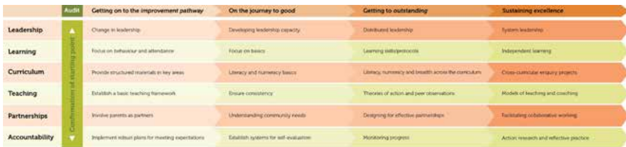
Figure 4: School improvement pathway

As a result of recent and ongoing school improvement work (Hopkins 2013, Hopkins and Craig 2016), there is now specific knowledge about the combination of strategies needed to move a school and a system along the performance continuum towards excellence. When systems and schools use this knowledge strategically they make significant and rapid progress.