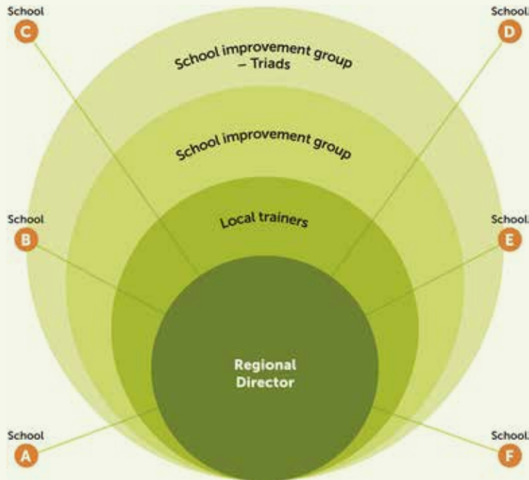
Figure 5: School improvement pathway